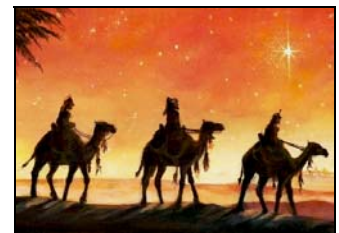
Feast of the Epiphany (Little Christmas) January 6