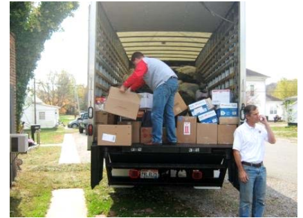
Time to unload the truck