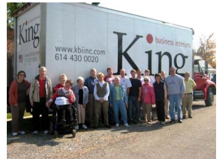
Knights, helpers and St. Francis Mission staff – another job well done!